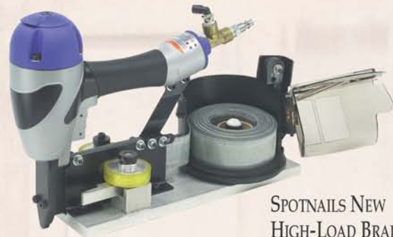
SPOTNAILS NEW HIGH-LOAD BRADDERS