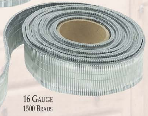
16 GAUGE 1500 BRADS