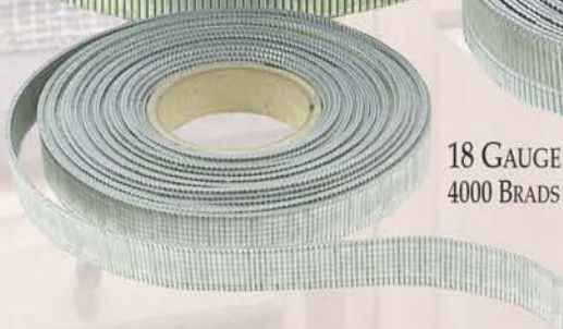
18 GAUGE 4000 BRADS