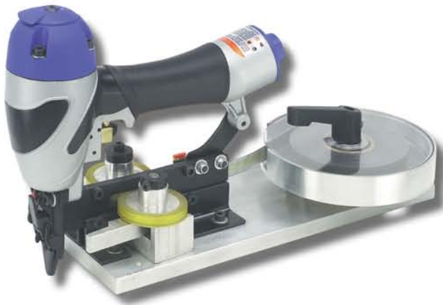
18 GAUGE TOOLS