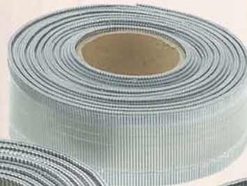
15 GAUGE 1500 BRADS