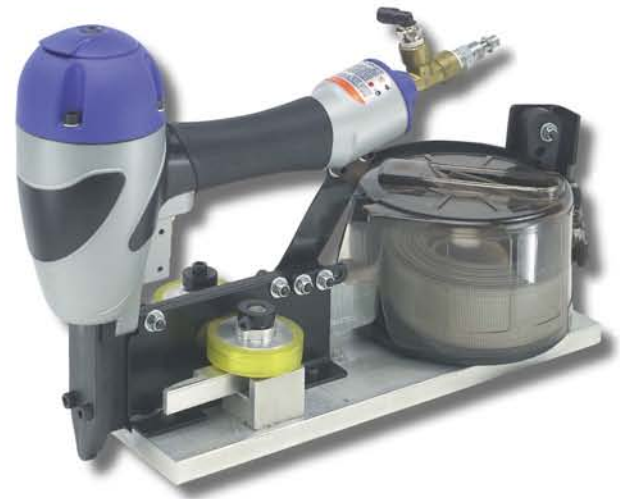
16 GAUGE / 15 GAUGE / 14 GAUGE TOOLS